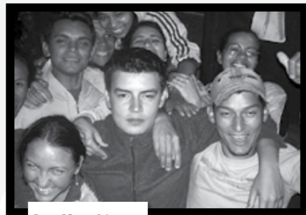
Leon House Ministry

I had to repair some damage to the house, in order to fulfill the contract so that it would be the same as it was when it was given to "Young Life," pay some pending bills, and there were some other activities that needed my attention in León, Nicaragua. We looked for another place to live, but still we were without a place to call home. The situation that we were in was very unstable, and stressful. A week before the trip I gave up and told God, "If you want us to be in León, please give us what we are missing," which was a place to live with a big enough space for the group activities, and also for the group leaders who would be living there. Also, an affordable rent, and a good location close to where we were before. By the grace of God, two days later we were signing a contract to rent a house to live in; the house was much bigger than the previous one, much less expensive and still close to the previous location.